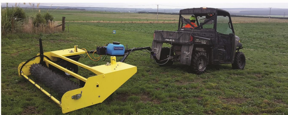
Fig.3. The first commercially-sized pre-production Spikey®2 (minus the foldable/removable side modules) being demonstrated on a Landcorp dairy farm near Wairakei.

ORUN® is the first treatment available for this purpose. Others are bound to follow. The first commercially-sized pre-production Spikey (Spikey®2) has now been built and is being demonstrated on dairy farms (Fig. 3).