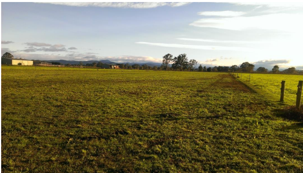
Photo 2: Example of residuals on Farm M - no clumps, approx. 1500 kg DM/ha.