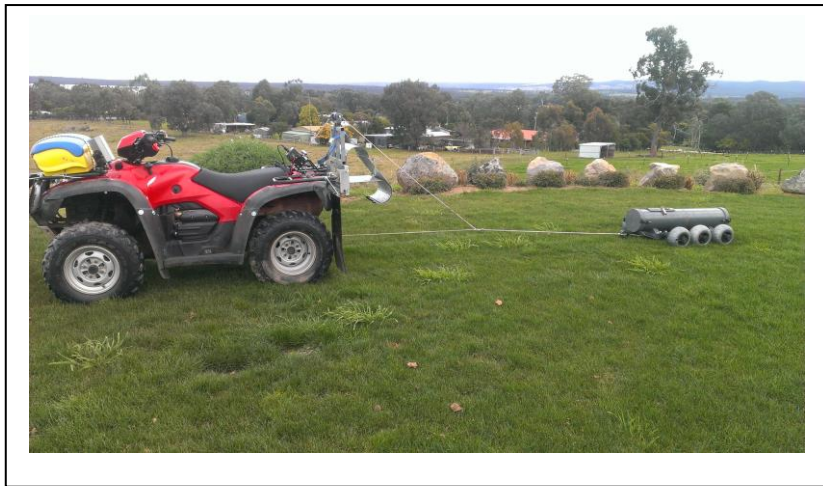
Photo 1. Geonics WM38 Mk 2 tow-behind electromagnetic moisture measurement in action. An example of a farm soil moisture map thus produced is shown in Fig. 2.

We are also in the process of implementing a system to measure and monitor soil moisture levels weekly ( every paddock ) with a tow-behind electromagnetic array (Geonics EM38 Mk2, as shown in Photo 2).